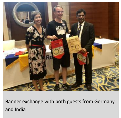
Banner exchange with both guests from Germany and India